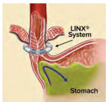
The magnetic attraction between the beads of the LINX implant augments the esophageal sphincter's barrier function to prevent reflux.

Two years ago, Rob decided to research his options. Fortunately, he lived just four