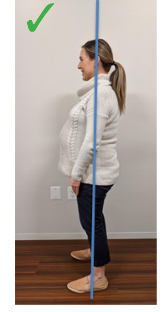
Ideal, trunk stacked over hips