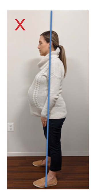
Belly forward, low back arched