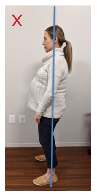
Leaning back, bottom clenched